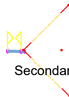
Secondary Road Half Section - Daylight Right