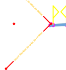
Secondary Road Half Section - Daylight Left