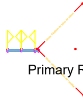
Primary Road Part Section - Daylight Right